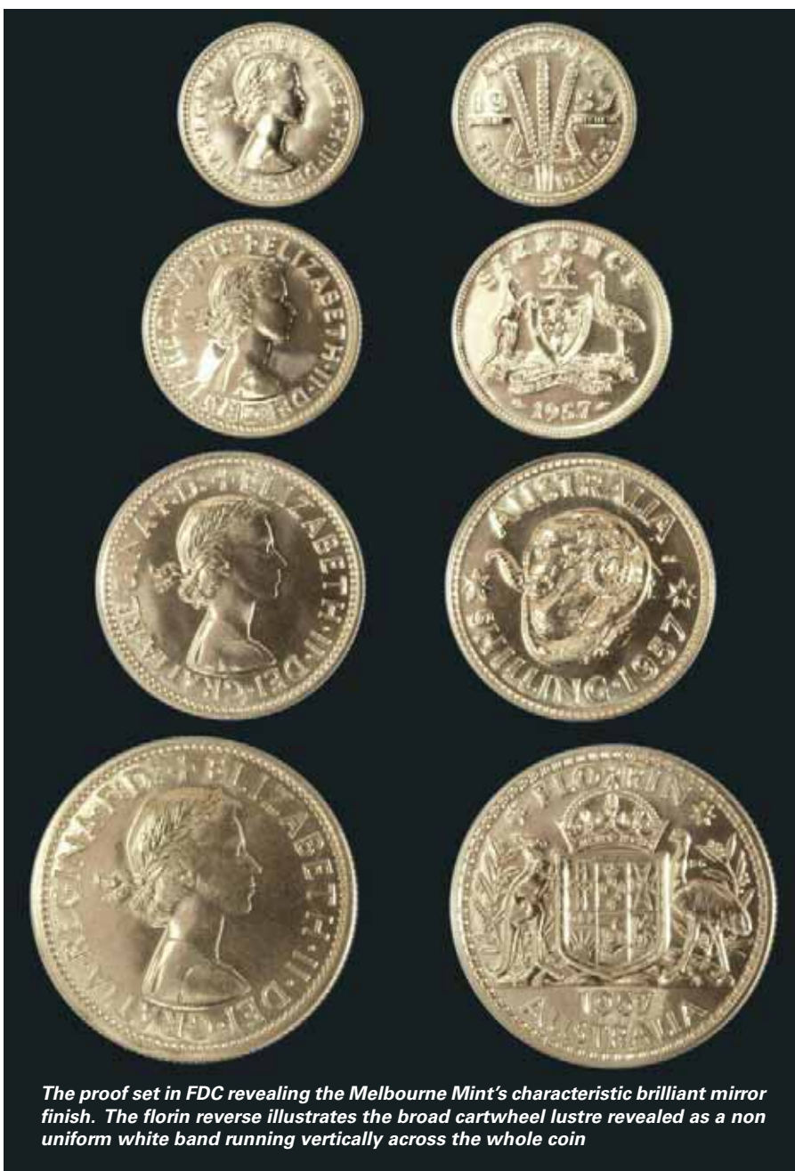
The proof set in FDC revealing the Melbourne Mint's characteristic brilliant mirror finish. The florin reverse illustrates the broad cartwheel lustre revealed as a non uniform white band running vertically across the whole coin