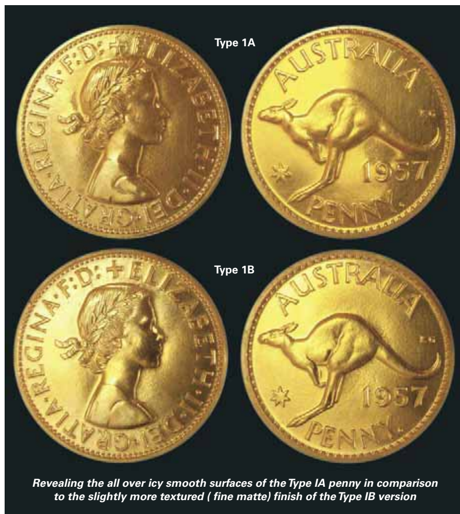
Revealing the all over icy smooth surfaces of the Type 1A penny in comparison to the slightly more textured (fine matte) finish of the Type 1B version