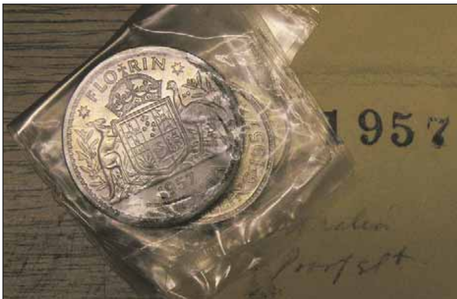
Figure 2 An example of the simple packaging used for the 1957 proof set